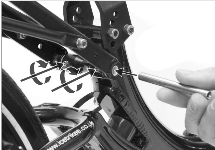
Insert pin through the rack ends and frame then tighten grub screws to secure it in place using 3mm allen key.