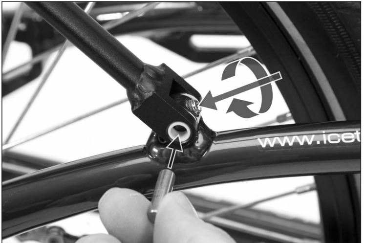
Insert pin through the rack ends and frame then tighten grub screws to secure it in place using 3mm allen key.