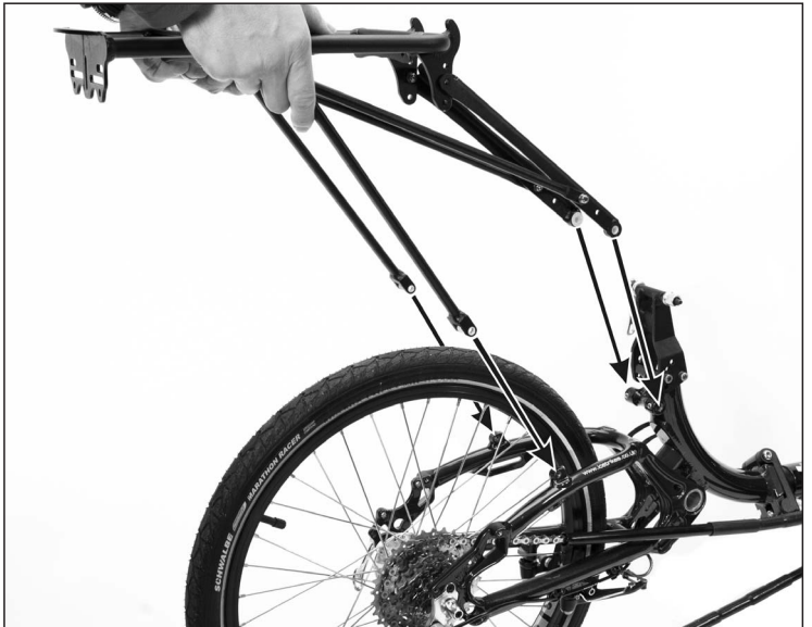
Position rack as shown on trike.